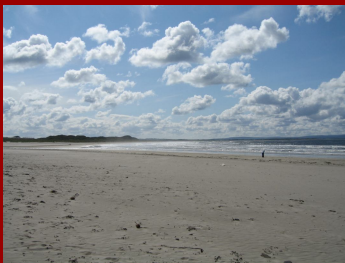
Enniscrone Beach Co Sligo

The Hotel comprises of 50 superb bedrooms (including 4 magnificent suites) Children's Play Centre, Beauty Salon & 12, 2&3 Bedroom Apartments. The rooms have been tastefully designed and come fully equipped with king size beds, tea/coffee making facilities and spectacular views of Enniscrone Beach and Killala